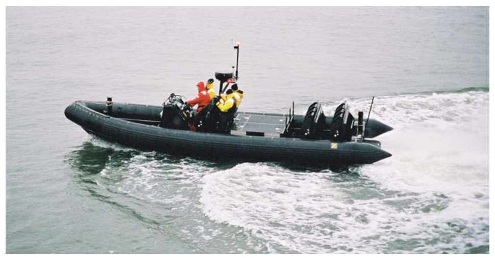
The overall appearance of the H1010 including all available Zodiac options is a protected trademark of Zodiac.

Disclaimer: Photos may vary with options Descriptions/Specifications are subject to change